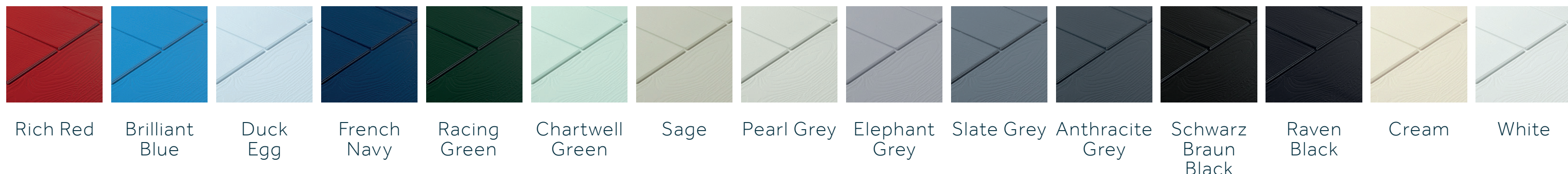
Rich Red, Brilliant Blue, Duck Egg, French Navy, Racing Green, Chartwell Green, Sage, Pearl Grey, Elephant Grey, Slate Grey, Anthracite Grey, Schwarz Braun Black, Raven Black, Cream, White

For a limited time only we are offering a select range of door designs, glazing options and colours for a very special price.